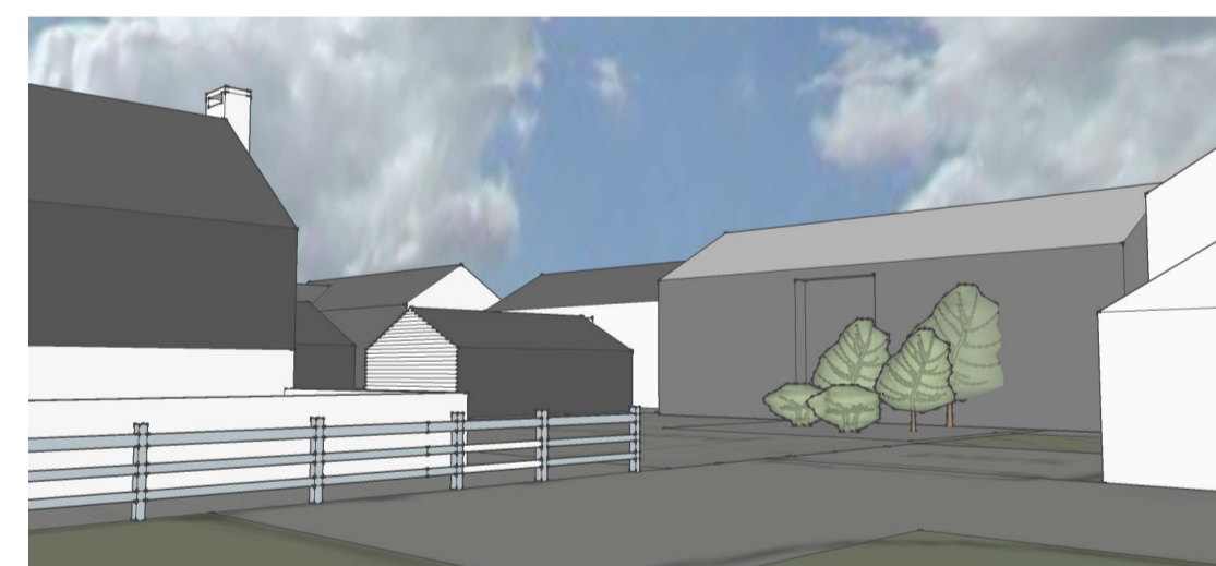
VIEW OF SECOND COURTYARD