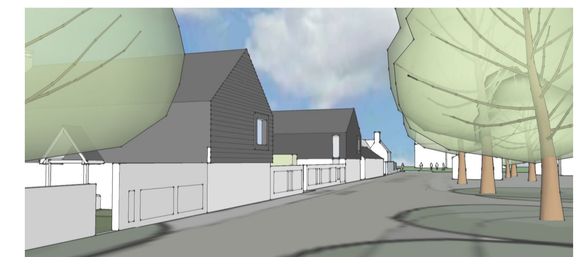
VIEW OF EXTENDED FLINT WALL AND DEVELOPMENT