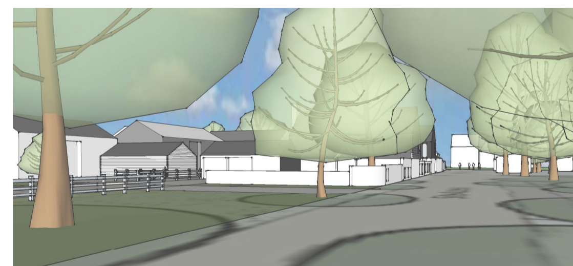
VIEW ALONG CHURCH LANE TOWARDS THE CHURCH