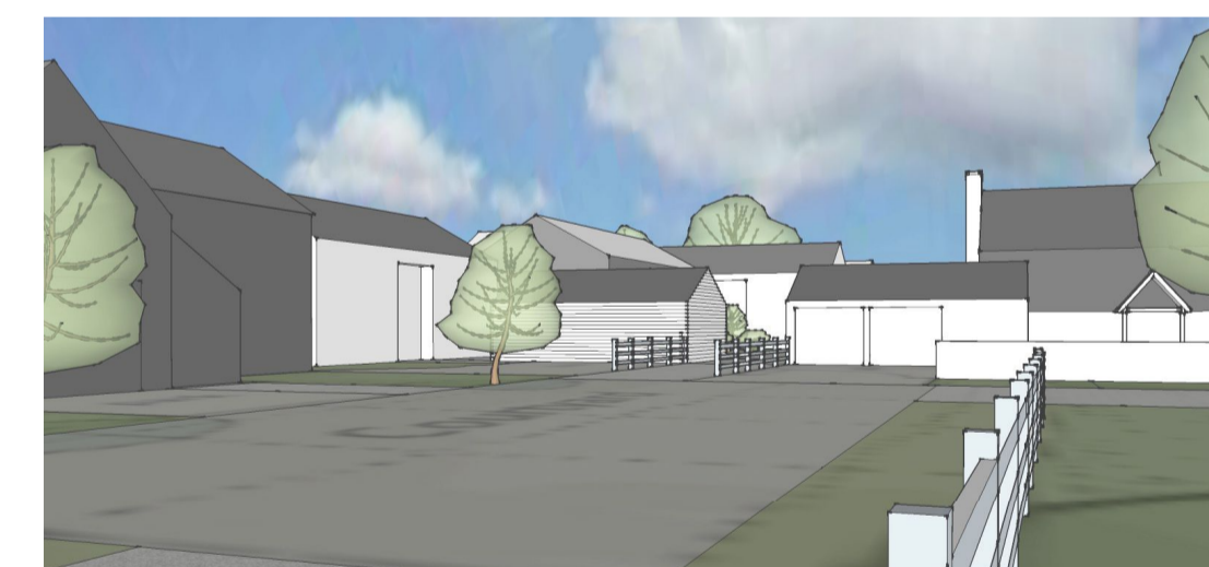
VIEW OF MAIN COURTYARD